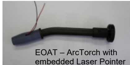
EOAT – ArcTorch with embedded Laser Pointer