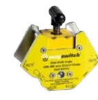
(1) Mini Multi Angle