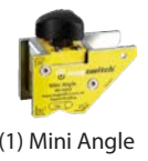
(1) Mini Angle